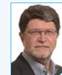
TONINO PICULA ISLANDS