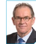
ALAIN CADEC ATLANTIC